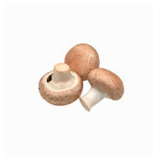
Champignon Riesen 2kg Champignon grandi 2kg 102104