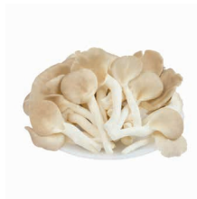
Austernpilze 3kg ITA Funghi Pleurotus 3kg ITA 102114