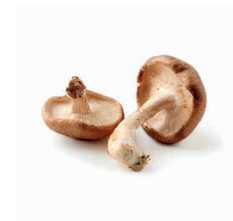
Shii Take Pilze ca. 1,5kg NED Funghi Shii Take ca 1,5kg NED 102121