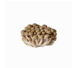
Pioppini braun Shimejii 150gr CHN Pioppini marroni Shimejii 150gr CHN 104511