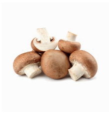
Champignon braun BIO 1kg Tirol Champignon marroni 1kg Tirol BIO 102103