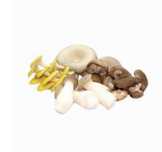
Pilze Mix 4x250gr NED Funghi misti 4x250gr NED 104504