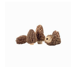
Morcheln ca. 3kg ROU Spugnoli Funghi verpe ca 3kg ROU 104516