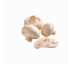
Champignon geputzt 2kg POL Champignon puliti 2kg POL 102109