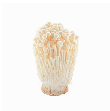
Enoki 100gr GBR Enoki 100gr GBR 104505