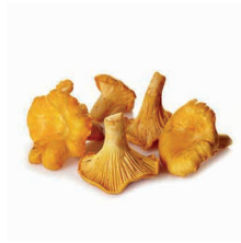
Pfifferlinge frisch klein 3kg RU Finferli (Gallinacci) freschi piccoli 3kg RU 106401