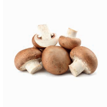
Champignon 3kg ITA Champignon 3kg ITA 102108