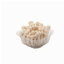
Pioppini weiss Shimejii 150gr CHN Pioppini bianchi Shimejii 150gr CHN 104510