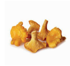
Pfifferlinge frisch unsortiert 4-6cm 1kg BY Finferli (Gallinacci) freschi non assortiti 4-6cm 106402