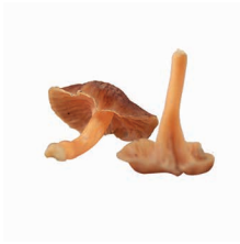
Herrennagerl ca. 2kg ITA Finferle ca 2kg ITA 104517