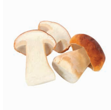
Steinpilze frisch halbiert ca. 3kg ROU Funghi Porcini freschi tagl. a meta ca 3kg ROU 106405