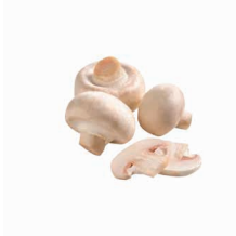
Champignon geputzt ca. 500g POL Champignon puliti ca 500g POL 102106