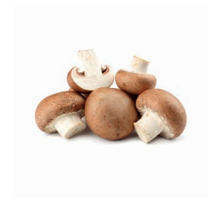
Champignon braun 3kg NED Champignon marrone 3kg NED 102105