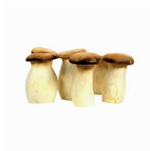
Kräuterseitlinge 2kg KOR Funghi Erengi Cardoncelli 2kg KOR 104501