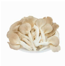
Austernpilze ca. 2kg POL Funghi Pleurotes - Geloni ca 2kg POL 102110