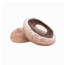
Portabella-Schirmling 1,5kg NED Portabella-Parasole 1,5kg NED 104513