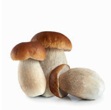
Steinpilze frisch ganz ungeputzt ca. 3kg POL Funghi Porcini freschi interi non puliti ca 3kg 106404